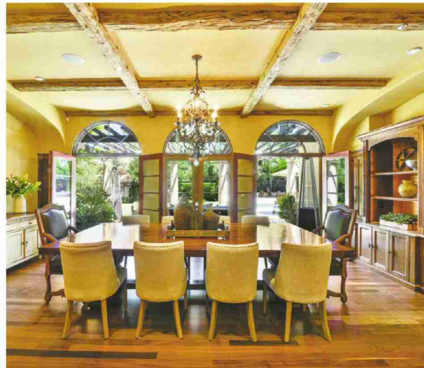
Above: The grand kitchen at 648 Glenside Drive in Lafayette features stone counters, a wine refrigerator and custom cabinetry. Below: The formal dining room features hardwood flooring, ceiling speakers and a built-in china cabinet.