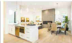
Oliga Soboleva / Vanguard Properties

The five-bedroom Mediterranean home at 648 Glenside Drive in Lafayette was completed in 2004.