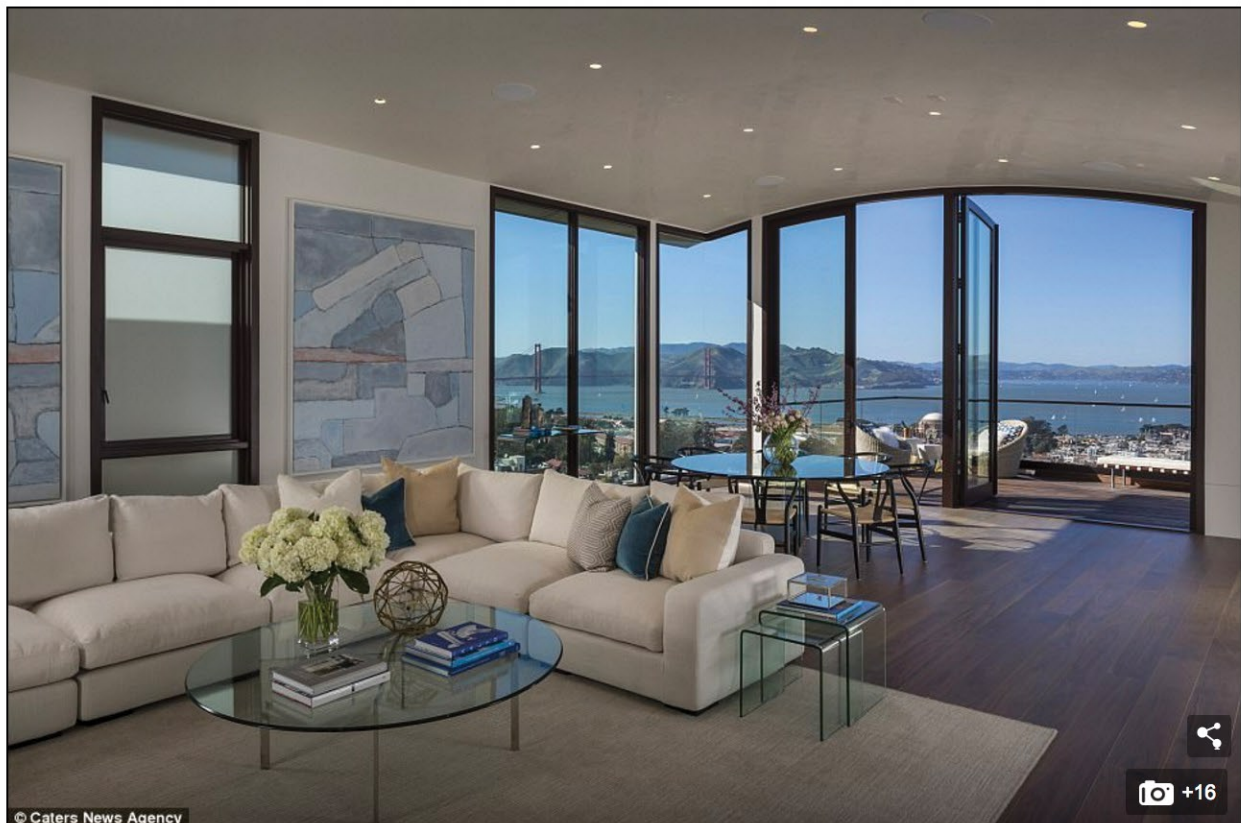
Luxury living: The bright and airy living space features glass doors that open out to a roof terrace with breathtaking views

'To have a house built to the latest seismic standards with a floor plan that works for today's lifestyle is truly unique. Many of the houses built on the Gold Coast have kitchens in the basement and do not have a garage.'