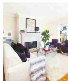
Steph Dewey / Reflex Imaging