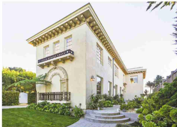
Above: The living room offers a wood-burning fireplace and original moldings. Below: 308 Sea Cliff Ave. is listed for $16 million.