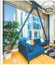
Oliga Soboleva / Vanguard Properties

The master suite at 308 Sea Cliff Ave. in Sea Cliff includes a wood-burning fireplace and views of the Pacific Ocean.